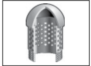
W-31-PERF and F1830-PD-3